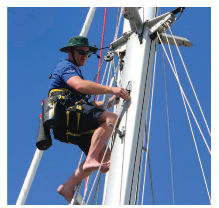
Fox's Rigging at work in Antigua

With dedicated departments all located on our own 15-acre site, Fox's is unique amongst the majority of boatyards today in that we provide a complete service in-house, with our own teams of highly skilled engineers and craftsmen, boat handlers, riggers, electricians and fabricators.