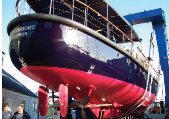
Before and after - repair work carried out by Fox's to Havengore's transom