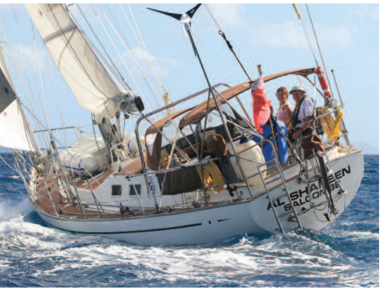
Happy owners on board Al Shaheen in the BVI after her refit at Fox's