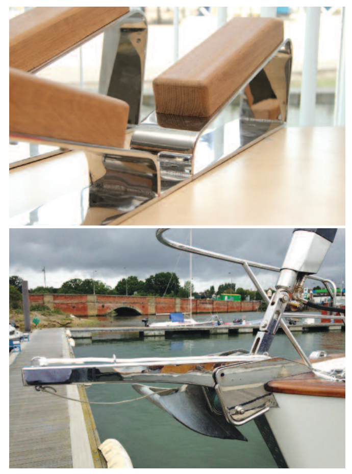
Custom dinghy chocks and bowsprit by Fox's Stainless