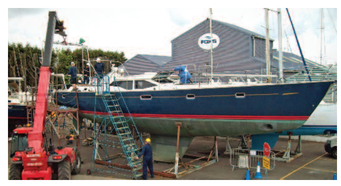
A custom aft gantry with solar panels and a wind generator fitted to Into the Blue

See the news section of our website for a short film of Yellowdrama's refit.