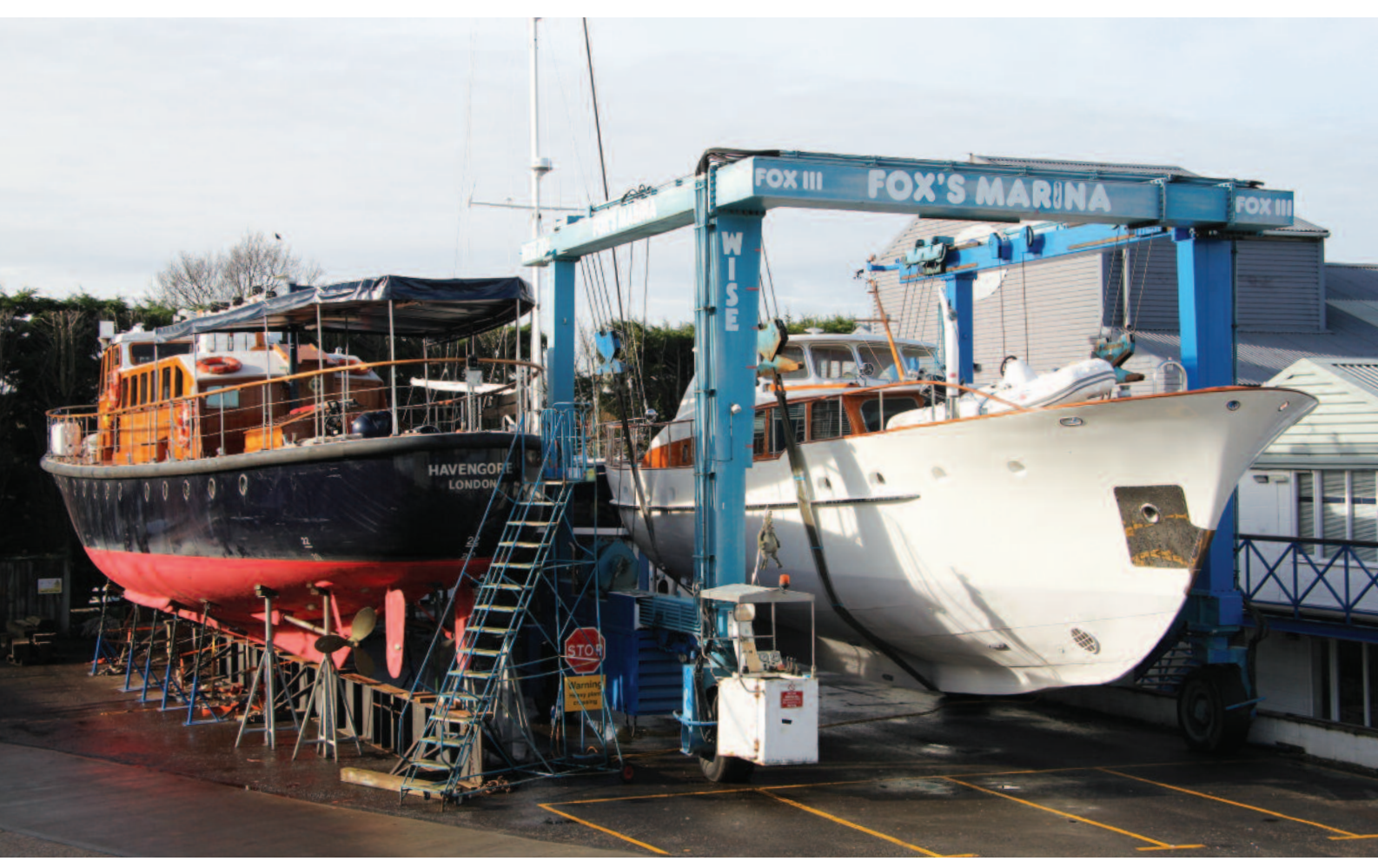
The 85' Havengore and 62' Feadship Tiky at Fox's for refit work

Fox's is proud to be a key supplier to some of the biggest names in British yacht building including, Oyster, Spirit, Gunfleet and Southampton Yacht Services and we regularly carry out repair work on behalf of most of the major insurance companies.