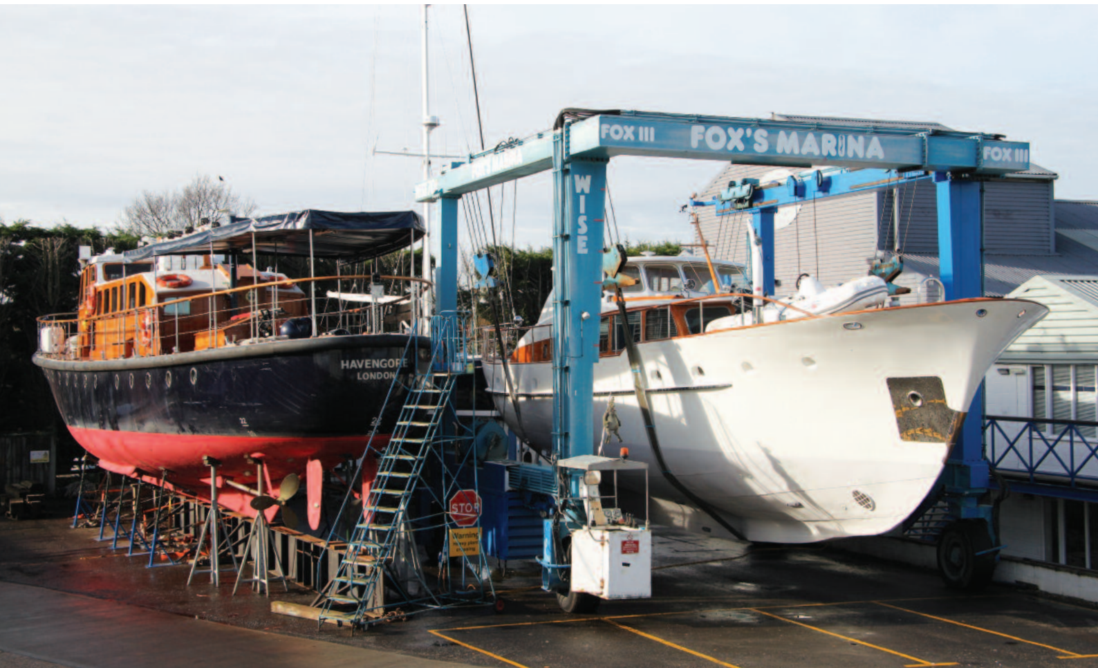
The 85' Havengore and 62' Feadship Tiky at Fox's for refit work

Fox's is proud to be a key supplier to some of the biggest names in British yacht building including, Oyster, Spirit, Gunfleet and Southampton Yacht Services and we regularly carry out repair work on behalf of most of the major insurance companies.