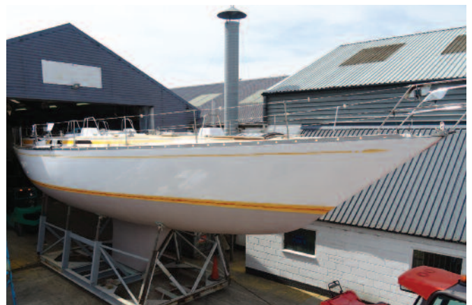
Good to go – the Swan 57 Yellowdrama IV on her way after her third refit at Fox's