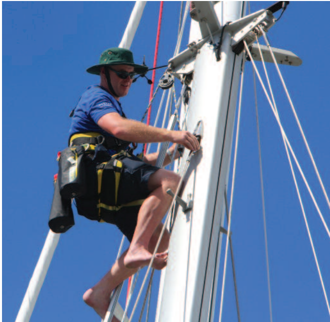
Fox's Rigging at work in Antigua

With dedicated departments all located on our own 15-acre site, Fox's is unique amongst the majority of boatyards today in that we provide a complete service in-house, with our own teams of highly skilled engineers and craftsmen, boat handlers, riggers, electricians and fabricators.