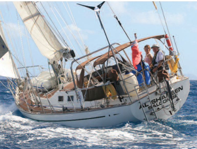
Happy owners on board Al Shaheen in the BVI after her refit at Fox's