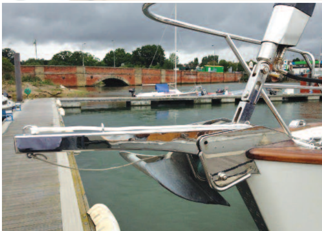
Custom dinghy chocks and bowsprit by Fox's Stainless