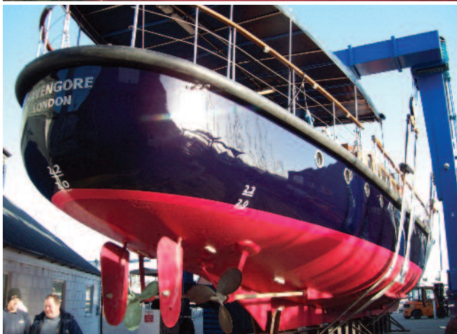
Before and after - repair work carried out by Fox's to Havengore's transom