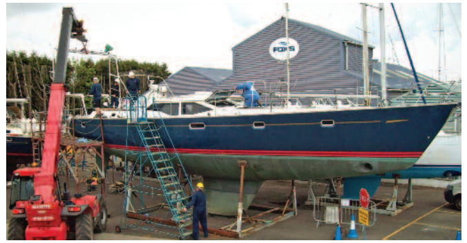
A custom aft gantry with solar panels and a wind generator fitted to Into the Blue